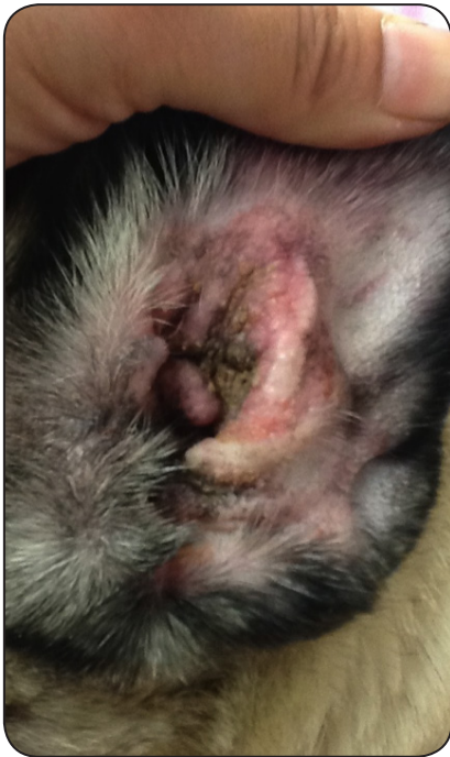
Day 1- 10/16