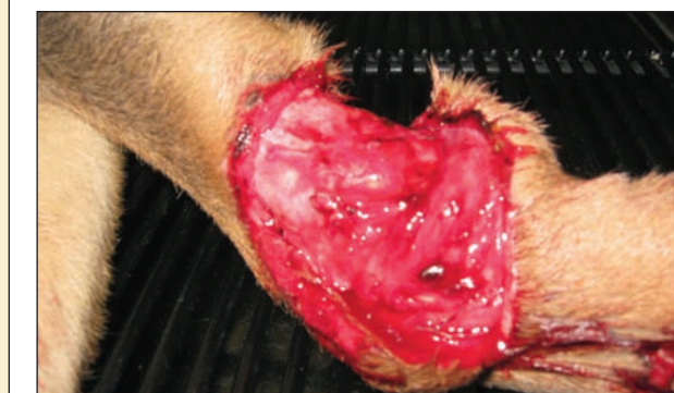
A degloving injury before laser treatment.

Other conditions that respond favorably include oral ulcers, otitis externa, stroke, gastroenteritis, pancreatitis, lick granuloma and myriad other things too numerous to mention. We are limited only by our willingness to try it,