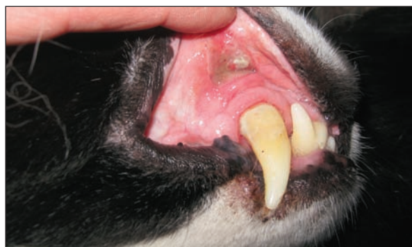
A canine oral ulcer before laser treatment.