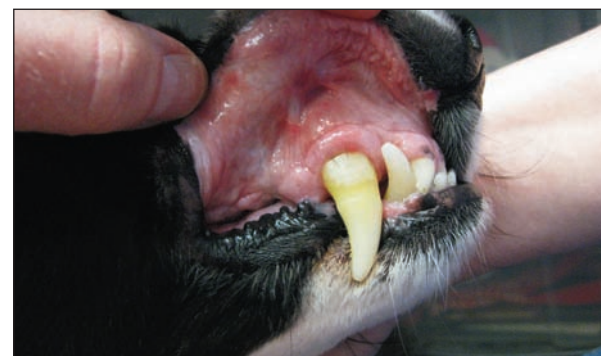
The oral ulcer looks much better after laser treatment.