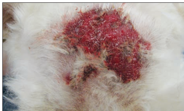
A bloody, painful hot spot before receiving laser treatment.