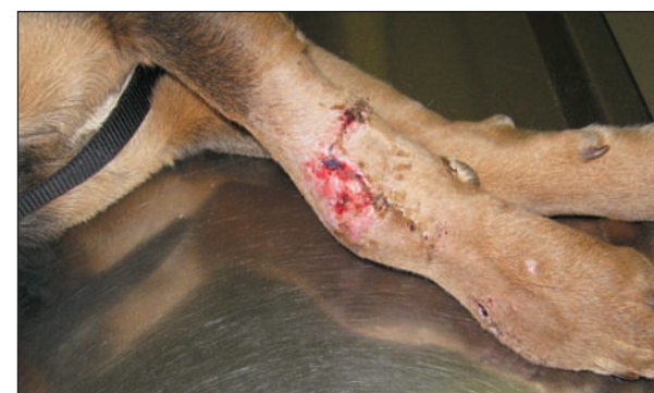
The same degloving injury after treatment.