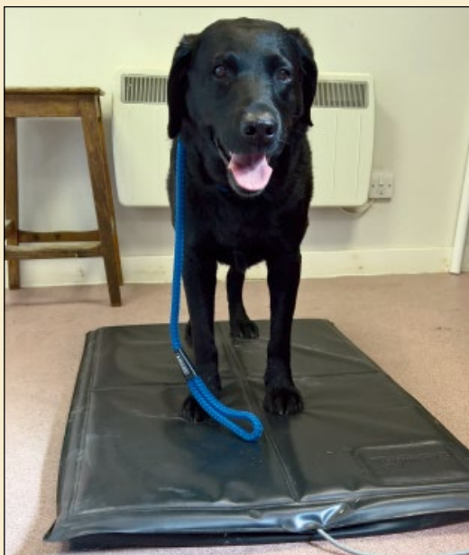
A stance analysis is performed using a four-quadrant mat.

PRP, with a platelet concentration of five times that of normal blood, was prepared using the Companion Therapy CRT system. Autologous PRP was then injected into the affected regions of the supraspinatus and bicipital tendon using ultrasound guidance. One milliliter of