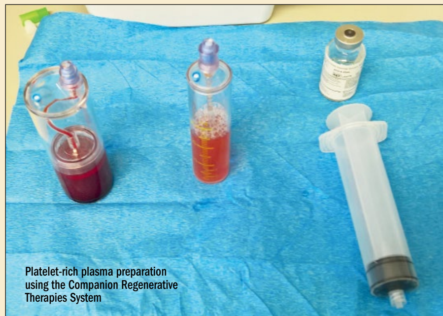
Platelet-rich plasma preparation using the Companion Regenerative Therapies System

Six months after treatment, Domino was exercising normally, displayed no lameness or stiffness, and was not receiving any pain medication. ●