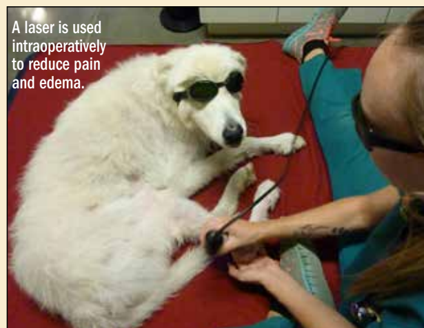
A laser is used intraoperatively to reduce pain and edema.