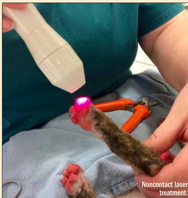
Noncontact laser treatment.