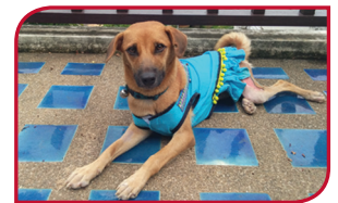
Convalescence in between treatments