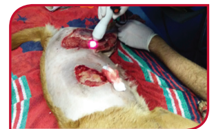
Post 4 treatments